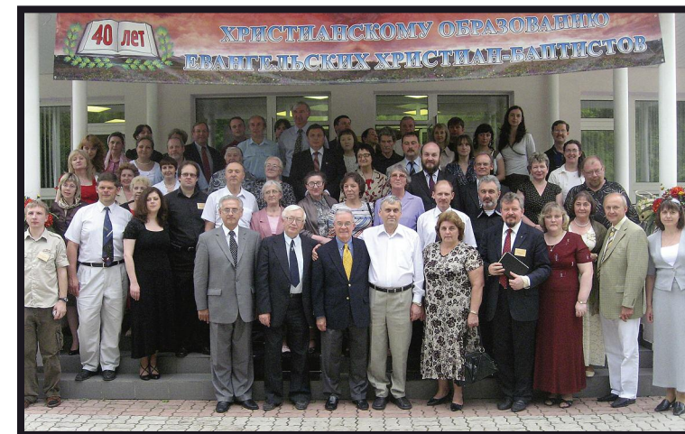
VISIT WWW.RUSSIANLEADERSHIP.ORG TO VIEW A SLIDESHOW OF THE CELEBRATION.

The day was a celebration of a fruitful harvest thanks to God's faithfulness, and a challenge to nurture the seeds which are even now being sown.