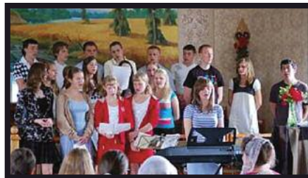
OUR YOUTH INSPIRE WITH SONGS OF PRAISE.

New people are drawn from the dark to Christ's life-altering light—all because of a little church on top of a mountain that refuses to hide its lamp.