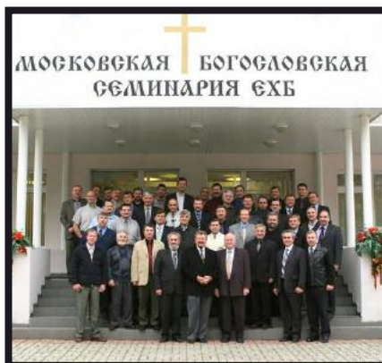
RUSSIAN BAPTIST UNION SUPERINTENDENTS GATHER FOR THE MTS MASTER IN MINISTRY SESSION.