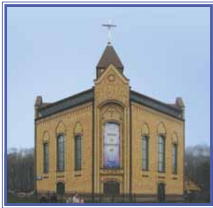
Golgotha Baptist Church, Moscow, Russia

Senior Pastor, Golgotha Baptist Church, Moscow