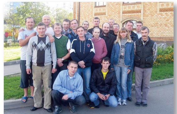
A group of students in the social rehab program. Each student is also the director of a church-based rehab center in their community.

He then met a man who told him about Jesus and recommended he go to a Christian rehabilitation center. Knowing he had hit rock bottom, he agreed to go. At the center, he was surrounded by genuine, caring people who shared the influence of God in their own lives. After